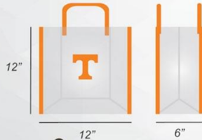
CLEAR BAG NO LARGER THAN 12" x 6" x 12"