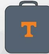
SEAT CUSHION NO ARMS OR POCKETS